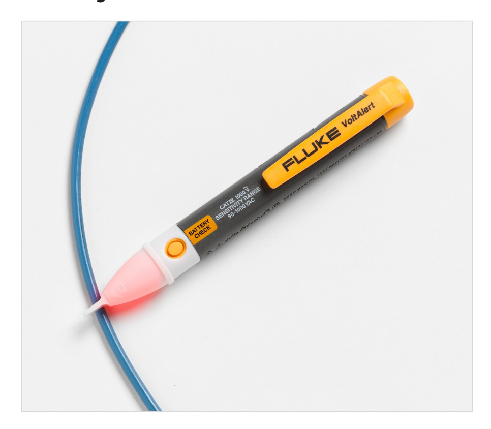
FLK2AC/90-1000V Fluke 2AC VoltAlert<sup>™</sup>Electrical Tester 90-1000V, straight tip for North American style outlets